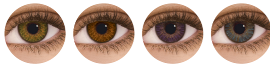
Pure Hazel Brown Amethyst Turquoise