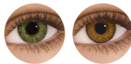
Gemstone Green Honey